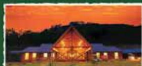
Timber Chalet Reception